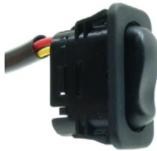
Universal control switch