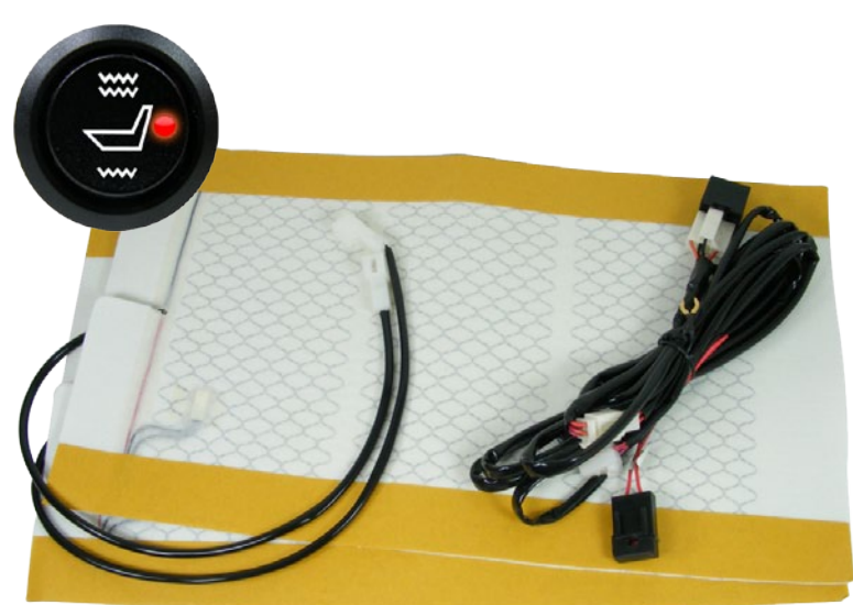
Seat heating system for one seat. 3-position rocker switch.