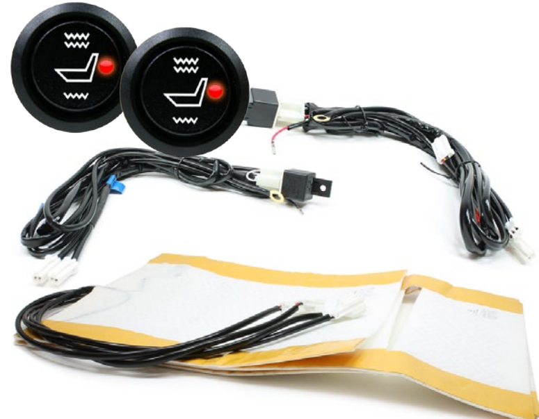
Seat heating system for two seats. 3-position rocker switch. Designed for 2012+Toyota Camry seats.