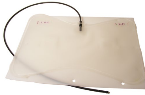
Air Bladder - 250-1453