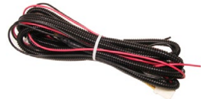
Universal wire harness