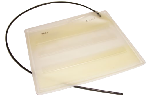
Air Bladder - 250-1454