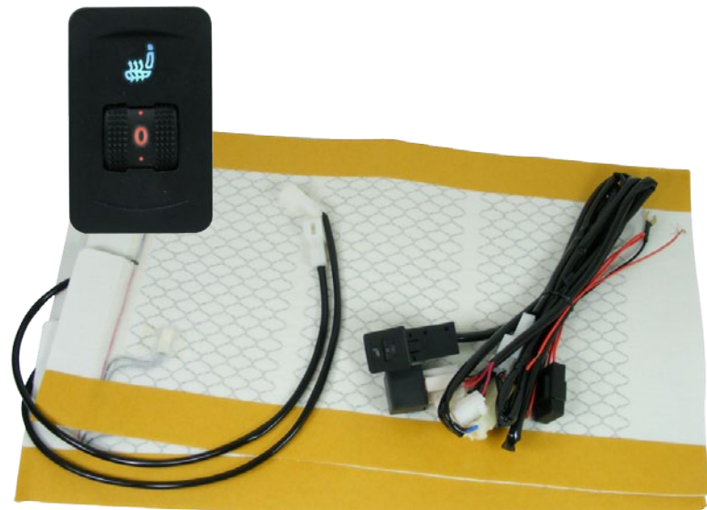
Seat heating system for one seat. 5-position thumb switch.