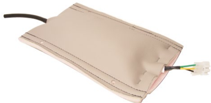
Under-seat pneumatic motor/pouch assembly