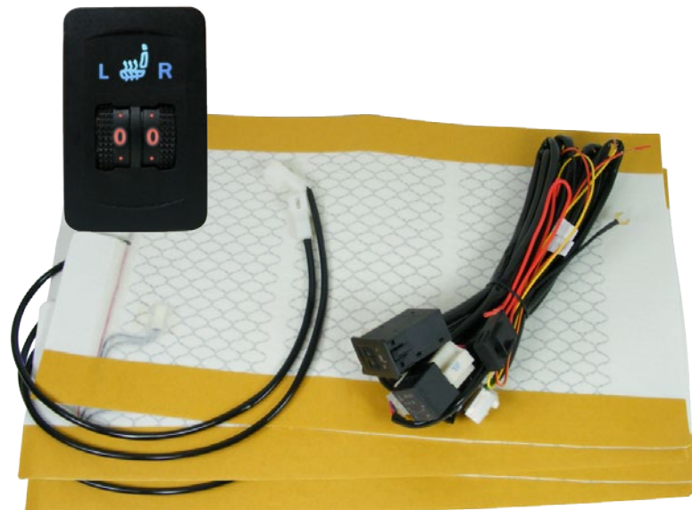
Seat heating system for two seats. 5-position thumb switch.