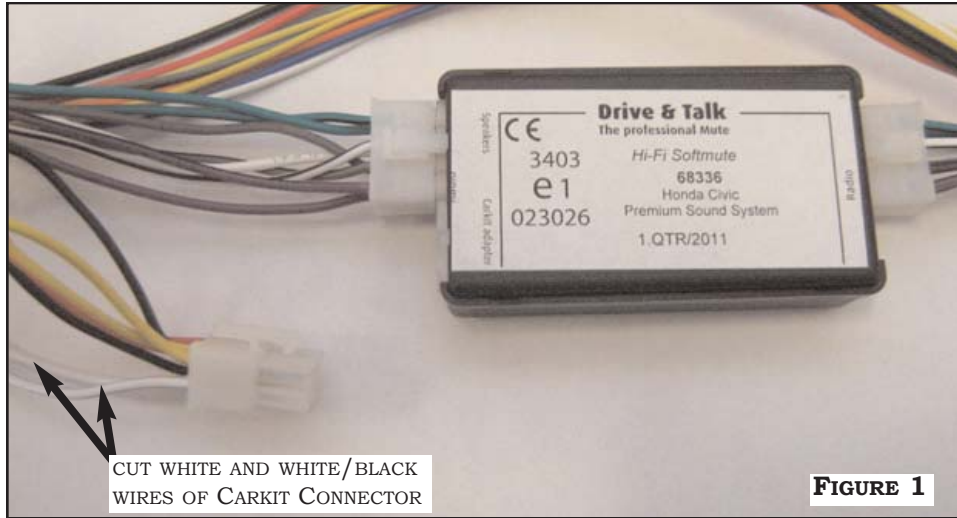
FIGURE 1: DISCONNECT CARKIT ADAPTER CONNETOR FROM BLUETOOTH HARNESS MODULE.