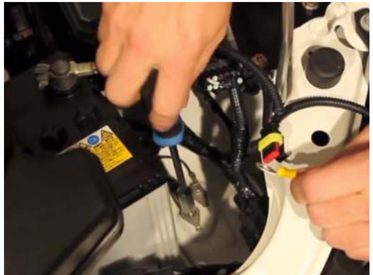
Connect the supplied ground wire to a chassis ground.