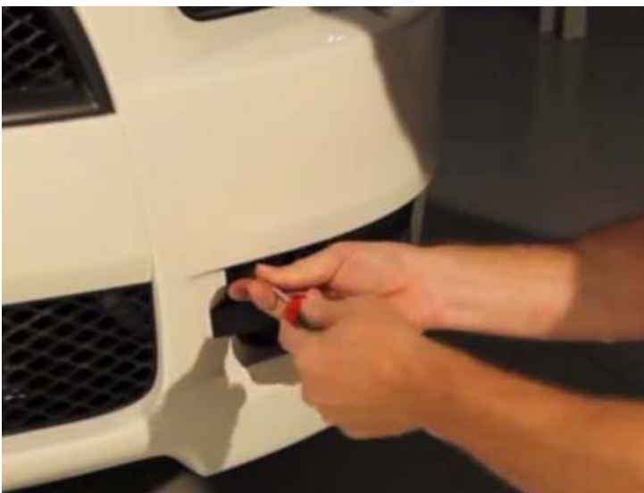
Install the new bezels in place using the single Phillips head screw while checking for secure fitment. Replace the radiator cover removed previously, reattach the negative battery cable and turn the ignition key of the vehicle to the ON position. The DRL lamps should illuminate to their full brightness with the ignition key switched ON and automatically dim when the headlamps have been powered ON at night.