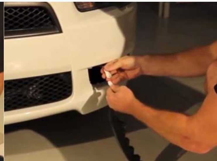
Connect the waterproof connector from the DRL extension harness to the connector on the DRL lamp.