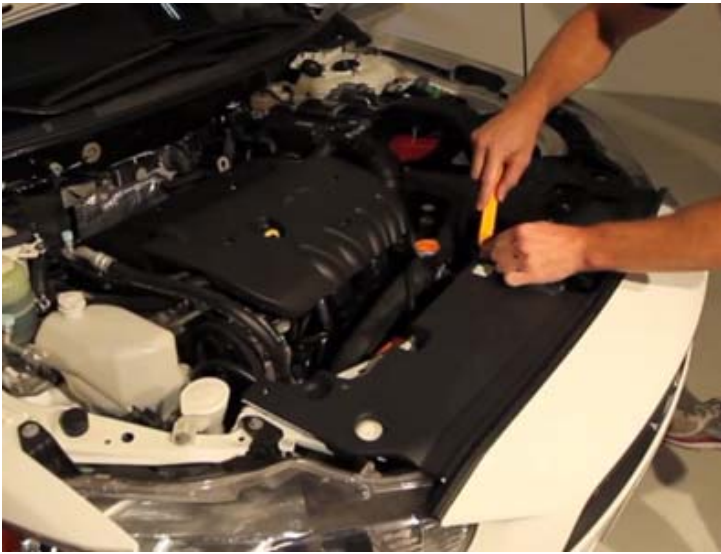
Remove the radiator cover from the vehicle.