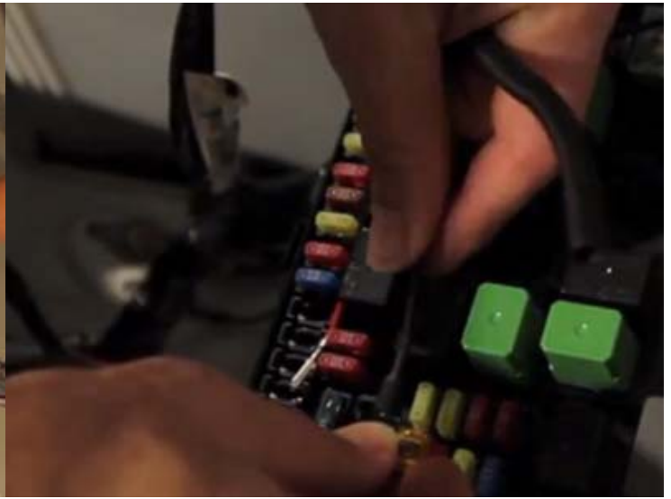
Connect the power harness to an accessory 12-volt fuse.