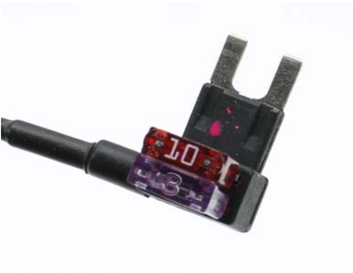
Note: The fuse holder must have two fuses installed.