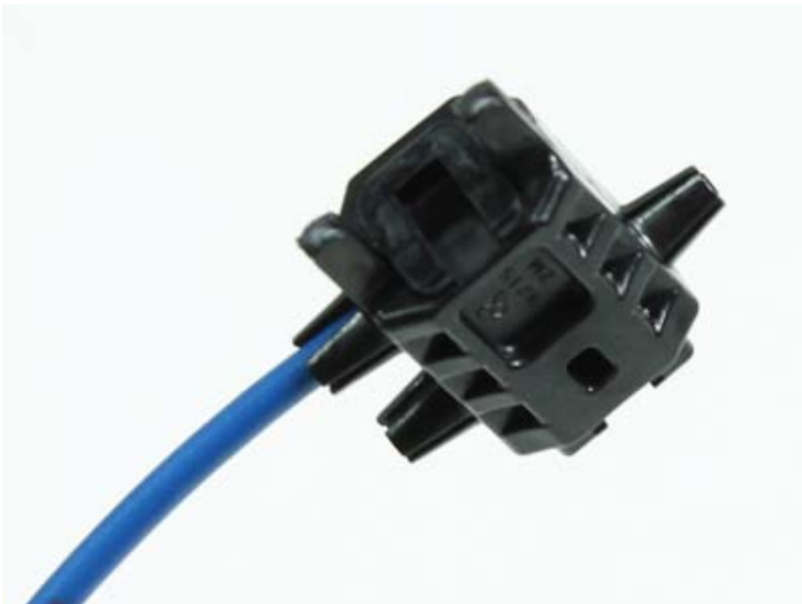
Connect the illumination wire to the headlamp wire: showing 12-volts when the headlamps are on.