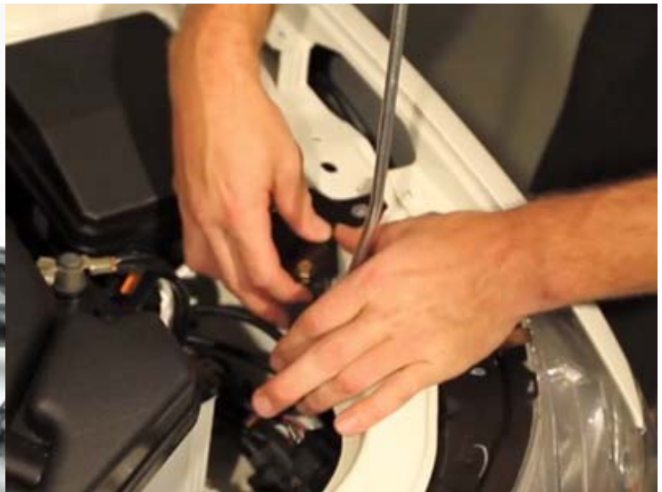
Using the included alcohol wipes and VHB tape, mount the ballast control module to the driver's side fender.