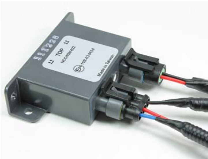
Connect the 3-pin female plug and DRL extension harness to the ballast control module.