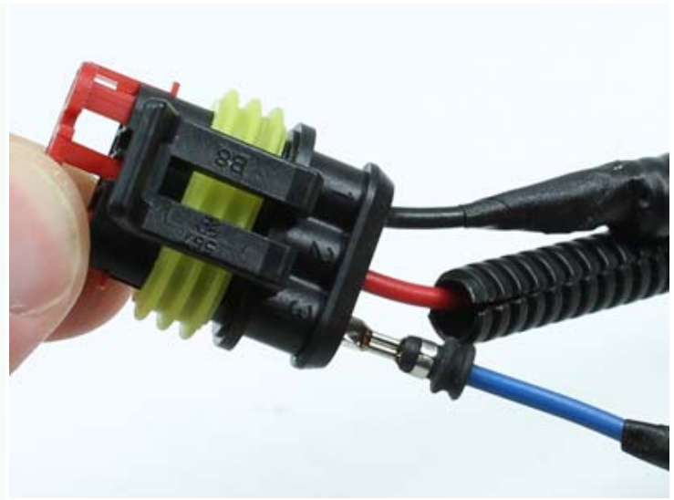
Insert ground (black), power (red), and illumination (blue) wires in female plug pins 1, 2 and 3 respectively.